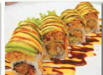
Double Decker Roll