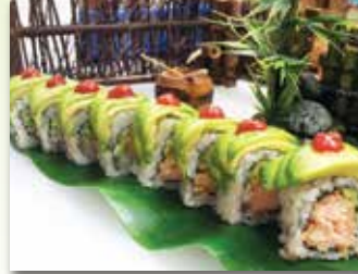
Salmon Surprise Roll

SINCE 2001 Maguro SUSHI HOUSE Japanese Cuisine magurosushihouse.com