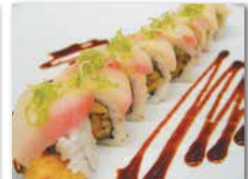
Yellowtail Lover Roll