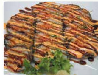
Spicy Tuna Tempura Roll