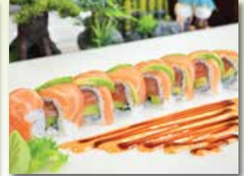
In & Out Salmon Roll